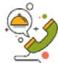
Customer and Loyalty Management