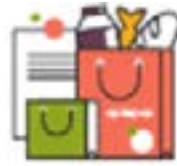
Take Away Quick Billing