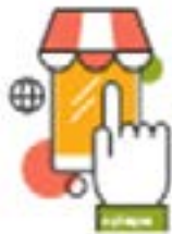
Table Order Taking