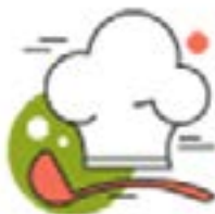
Kitchen Order Printing